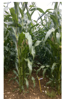
DAP @ 125kg/ha + Polysulphate @ 30kg/ha