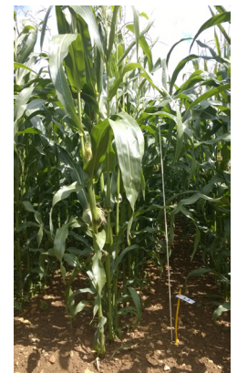
DAP only @ 125kg/ha